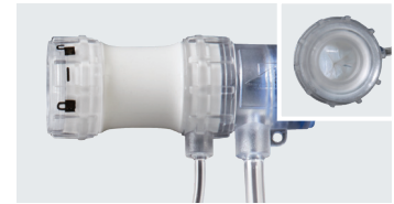
Figure 2. GORE® DRYSEAL Valve after pressurization.