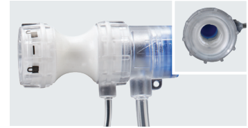
Figure 1. GORE® DRYSEAL Valve before pressurization.

In the event the GORE® DRYSEAL Valve fails (rupture of the inner film tube), clamp or twist the GORE® DRYSEAL Valve or insert the dilator to prevent blood loss. These actions are shown in Figures 4–6 .