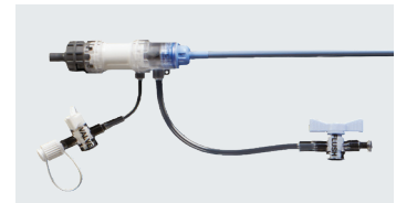
Figure 3. Pressurized with 2.5 ml saline.