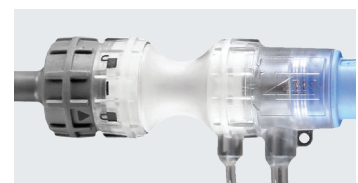
Figure 6. Lock cap.