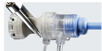
Figure 4. Clamp.