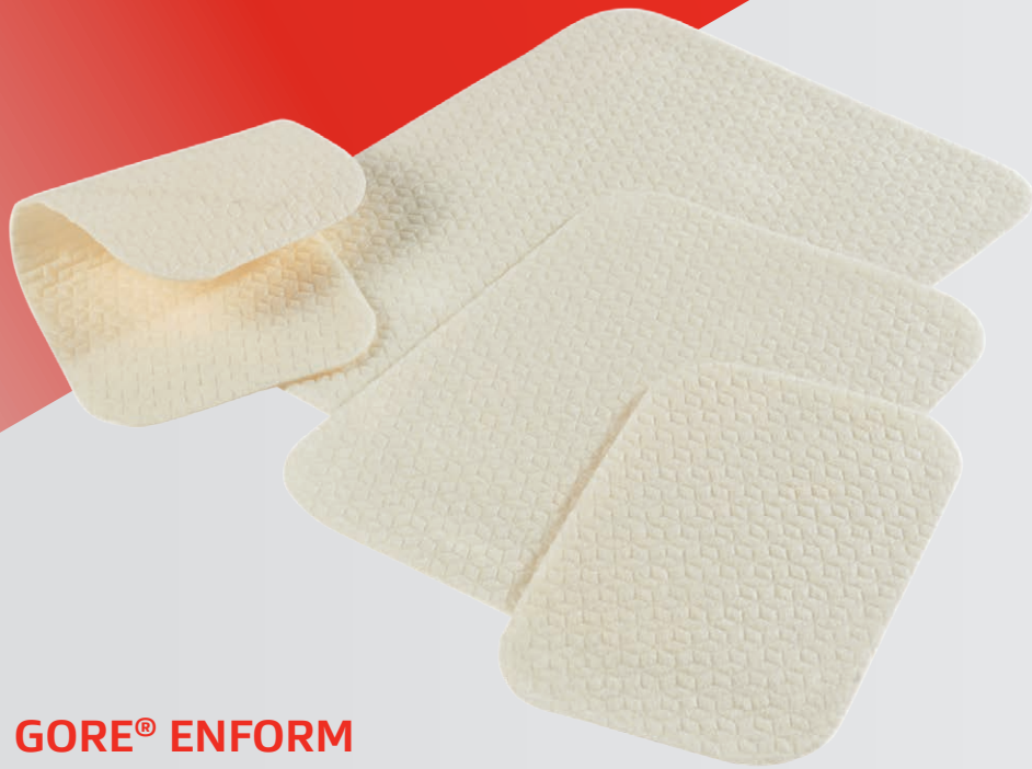
GORE® ENFORM Preperitoneal Biomaterial