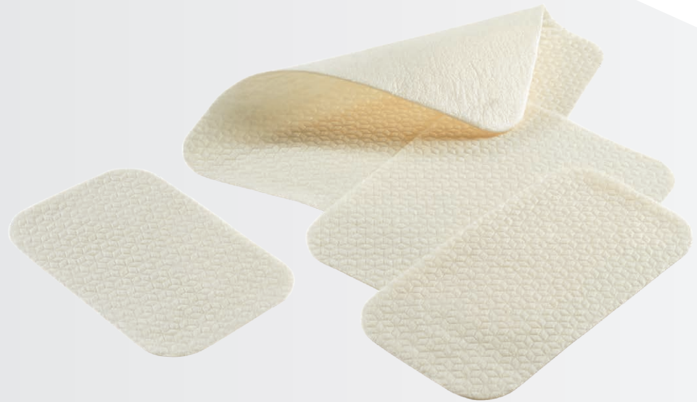
GORE® ENFORM Intraperitoneal Biomaterial