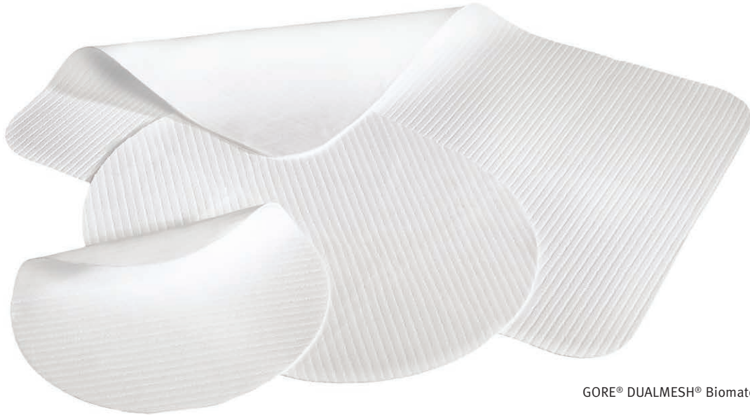
GORE® DUALMESH® Biomaterial